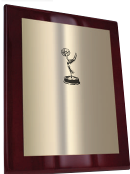
Nomination Plaque: $150 8 x 10 Rosewood Finish Plaque commemorating Emmy® Award nominations.

Was your work nominated for or awarded an EMMY® over the years? Was a co-worker or collaborator not included because of budgetary constraints? It's never too late to purchase a beautiful plaque or crystal award celebrating these contributions. Select from elegant, high gloss rosewood finish plaques personalized with an inscription celebrating your accomplishment, or our beautiful, translucent art glass featuring an image of the Emmy® statuette and your own personal information. Student Awards for Excellence Pillars are also available, with your accomplishment sandblasted and gold color-filled on optically clear crystal. All prices include engraving and shipping.