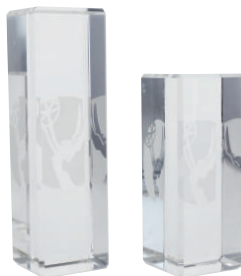
Student Pillar: 6": $135 8": $150 Optical Crystal Pillar with your inscription etched and gold filled.