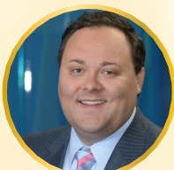
TODD FAULKNER NEWS ANCHOR, WPSD