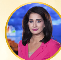
PJ RANDHAWA INVESTIGATIVE REPORTER, KSDK