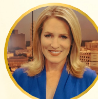
ADRIA GOINS MORNING NEWS ANCHOR, KSLA