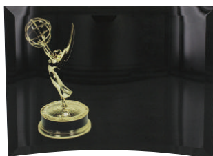
Art Glass: $150 10 x 7 Curved Translucent Art Glass, depicting Emmy® Statuette and your own personal copy.