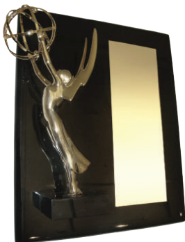
Plaque with "life size" EMMY® Statuette. $400. 10-1/2 x 13 Ebony Finish Plaque. For those who contributed to the EMMY® AWARD winning work. Can be personalized