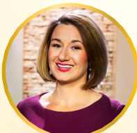
ASHLEY REYNOLDS CONSUMER INVESTIGATIVE JOURNALIST, KY3/KSPR