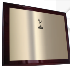
Production Plaque: $150 10-1/2 x 13 Rosewood Finish Plaque commemorating Emmy® Award nominated productions.