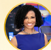
DONNA TERRELL EVENING NEWS ANCHOR, FOX16 KLRT-TV